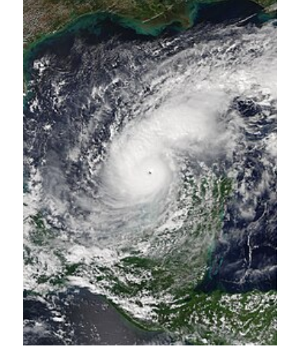
Hurricane Milton makes landfall near Sarasota October 9, 2024.

The ELC, through the <u>Florida Division of Early</u> <u>Learning</u> assisted preschools in need by easing protocols and helping to navigate regulations so that schools could reopen as soon as possible.